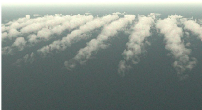
Figure 3: A. Front-on view of the Horns Rev wind farm (Vattenfall). B. Numerical simulation [4]