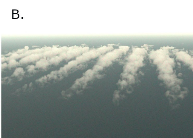
Figure 3: A. Front-on view of the Horns Rev wind farm. B. Numerical simulation [4]