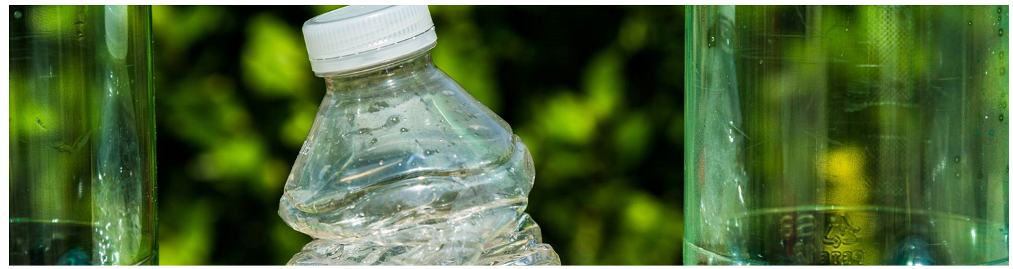
Written on 22 June 2021