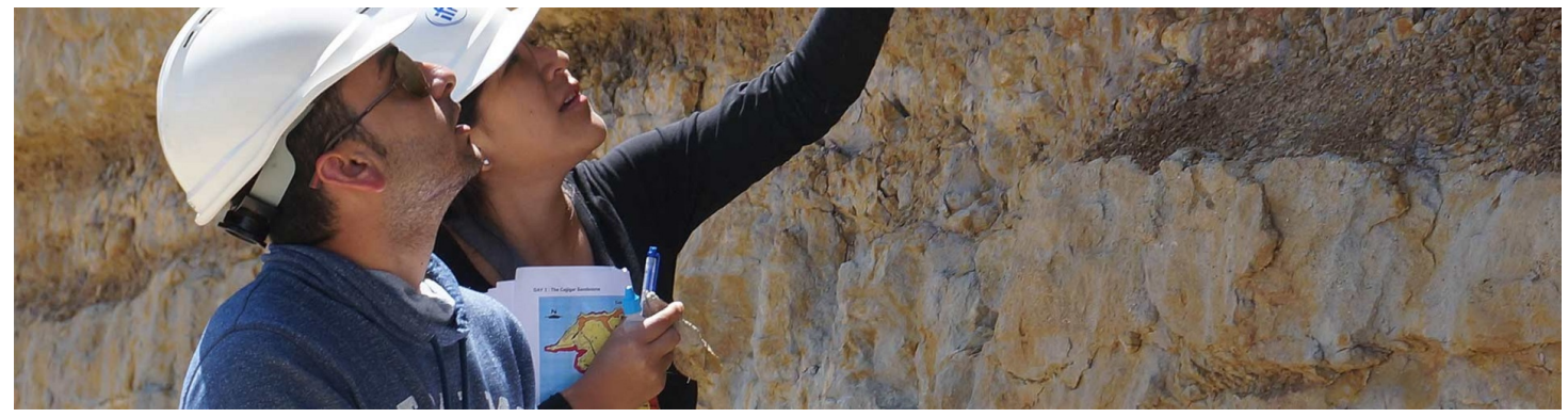
Written on 03 December 2021