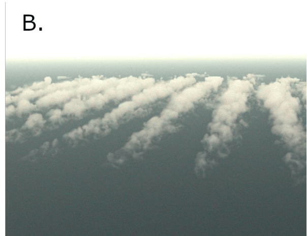
B. Numerical simulation of the system photographed. Joulin et al 2020.

The excellence of IFPEN’s expertise in the field of ‘system control’ was recognized in 2019 at a prestigious international competition dedicated to wave energy conversion.