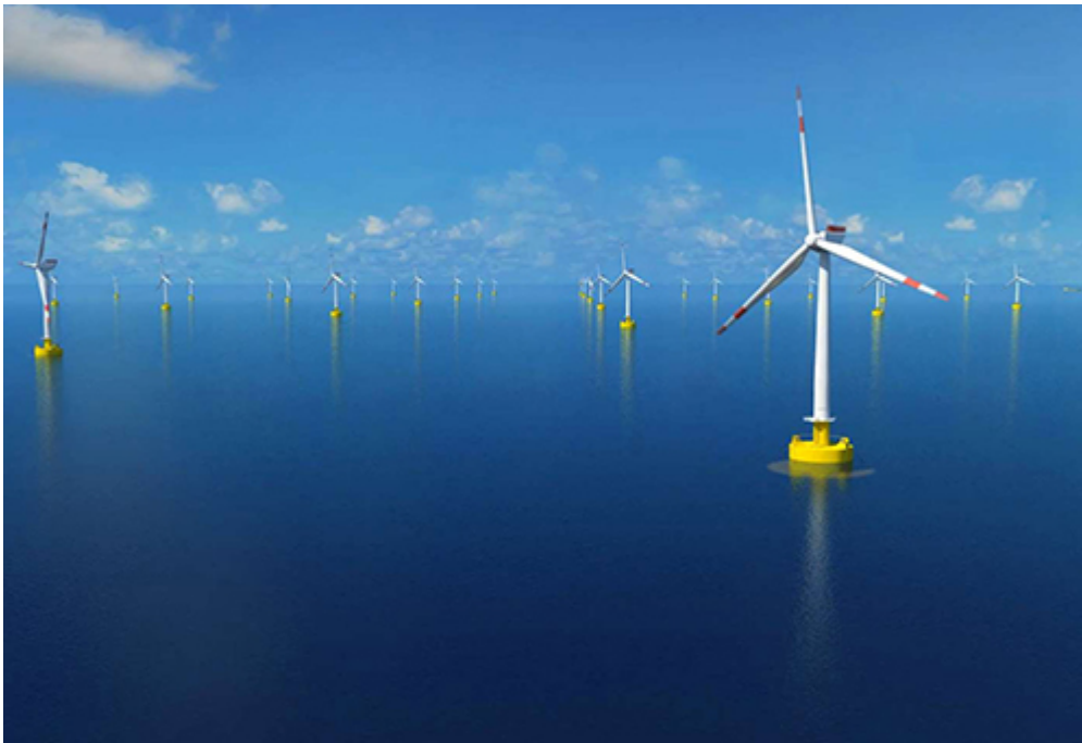
An offshore wave energy converter

In January 2011, a research and innovation program was launched dedicated to offshore wind power and ocean energies, with a focus on floating wind turbines. In 2012, further projects were launched on wind turbine control and wave energy conversion control, which employ methods developed within the context of the fundamental research program concerning system optimization and control (scientific challenge 7) .