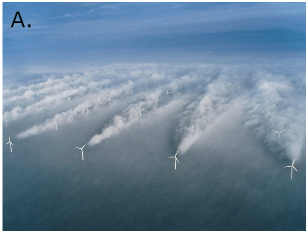
A. Horns Rev 1 wind farm (Hasager et al., 2013).

forecasting model led to the development of an “expertise-specific” software solution making it possible to optimize the layout of turbines at a wind farm. Significant productivity gains are expected in the offshore context where wake-related energy losses can be as much as 40%.