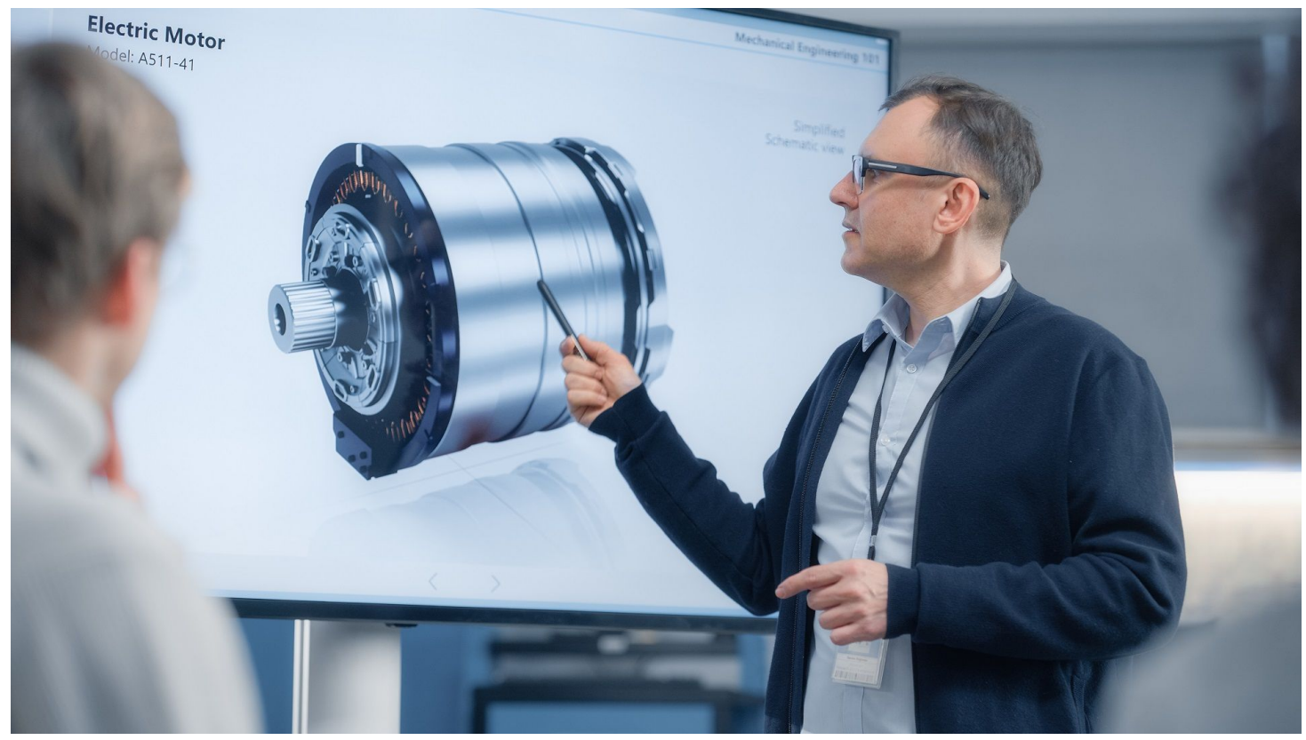
Written on 14 September 2023