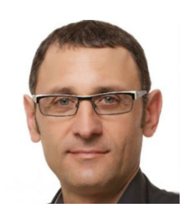
Written on 04 June 2018