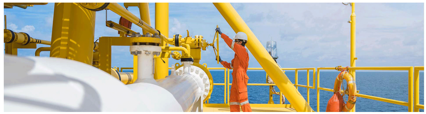
Written on 23 September 2019