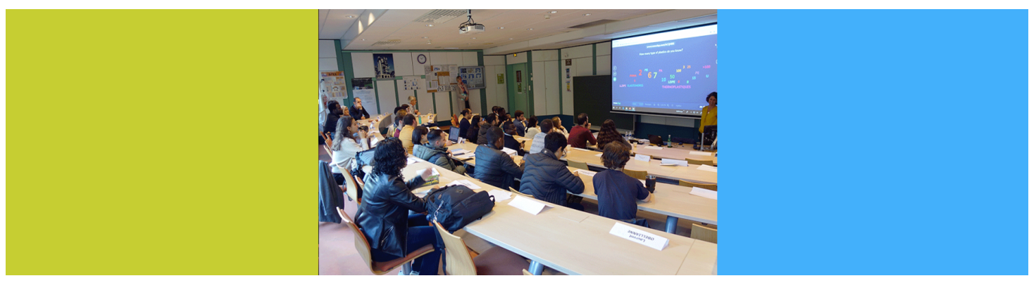
Written on 30 October 2019